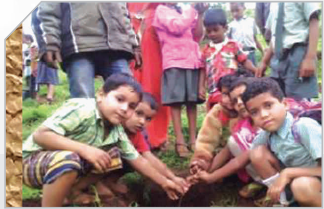
Healthy kids planting seeds