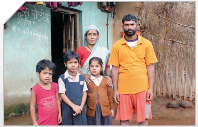
The buds are blooming on the fertile land...