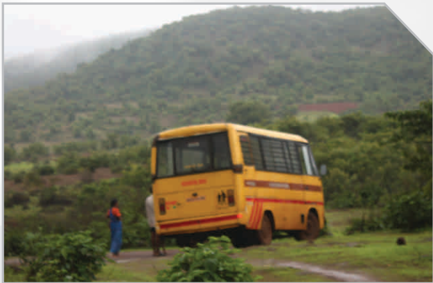
Reaching the school by surmounting the natural calamities