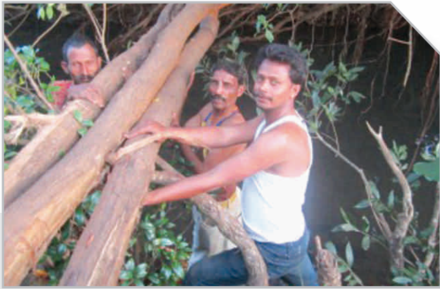
Going to school by means of most unusul ways...