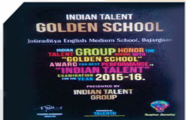
The Sanstha had started the school in order to uplift the students from the economically weaker communities .