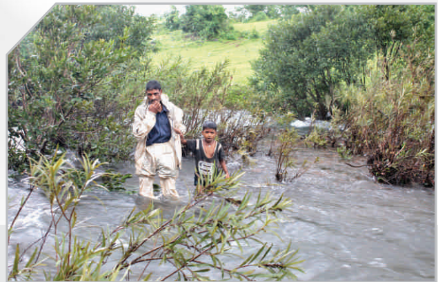
Crossing The water current to reach the school