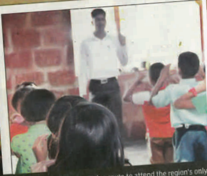
Children from villages in the Western Ghats have to walk through forest area and travel along a 30-km route to attend the region's only English medium school. The school started by local youths has appealed to parents for the bus service it provides through the rough road. Its popularity has meant that the state-run Marathi schools wear a deserted look.