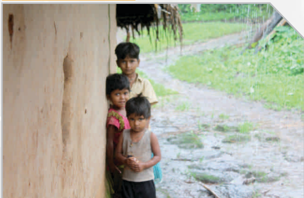
Rising fate of mother india